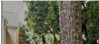
3. Stepping stone pathway leading from the paver parking around the Club leading to the basement (yes, we have a basement!)