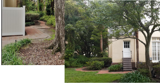
4. ... and continuing to the back entrance for the AV/Linen room. (Yes, we have a back entrance to the AV/Linen room) 😊

5. and 6. Oops, how did these get mixed in?? Miss T, 3 mo. & soon to be 4 mo.