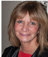
Sue Grafton Scholarship