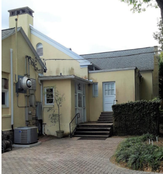
1. Before: Catering Entrance

Another busy month completing exterior projects outlined in the-May Highlights. Happy to share some pictures and are hoping you will come visit soon to see in person! The gray skies don't do justice to the finished projects, however, just couldn't seem to get the weatherman to cooperate (plus, my photography skills could use a little coaching from Churchill!) 😊 Enjoy!