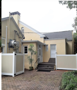
2. After: Old Kitchen window AC removed with opening rebuilt and covered. Old roof AC removed and new installed on the ground, then enclosed. New matching enclosure for the trash bins.