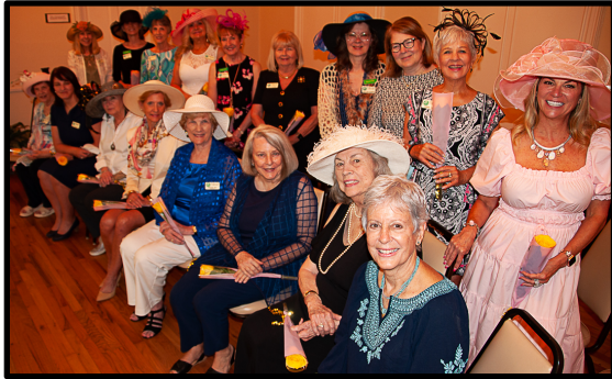
2022-2023 The Woman's Club of Winter Park Board