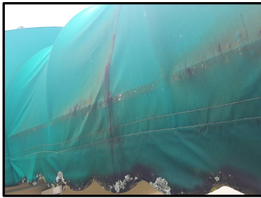
Awning Before Cleaning