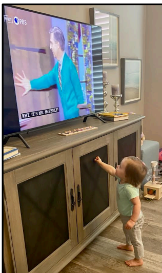
My Tessa, now 3 years old, still loves watching Mister Rogers just as she did at 13 months.