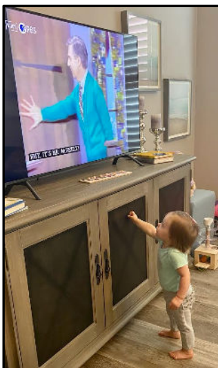
My Tessa, now 3 years old, still loves watching Mister Rogers just as she did at 13 months.