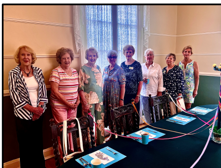
President/Past President's Luncheon Held at the Clubhouse, May 18th

Our office is still open if you need to reach out, and our building is available for rentals should you or anyone you know need to plan an event. We are here for you and our community.