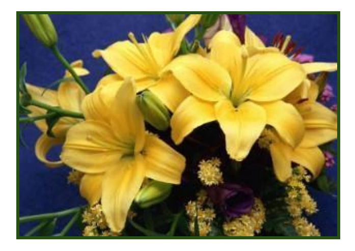
Thank You for an Incredible Season!

As we wrap up this season, we wanted to take a moment to express our heartfelt gratitude for all of your support and assistance. Your dedication and enthusiasm have truly made a difference in our club's success. Thank you for the extra time and effort you put in each week to make our events so special—from the beautiful decorations that transformed our space to the delicious food that brought us all together. Each contribution has been invaluable, and we couldn't have done it without you! Our programs committee is already busy planning for next season, and we are excited about what's coming up. We hope you all have a fantastic summer break filled with quality time with family and friends, as well as some wonderful travel adventures. We look forward to seeing you in September, ready to create even more memorable moments together. Enjoy your summer!